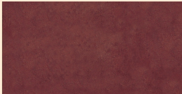
English Red Stain Terra Cotta with Rust and Soft Brown Hues