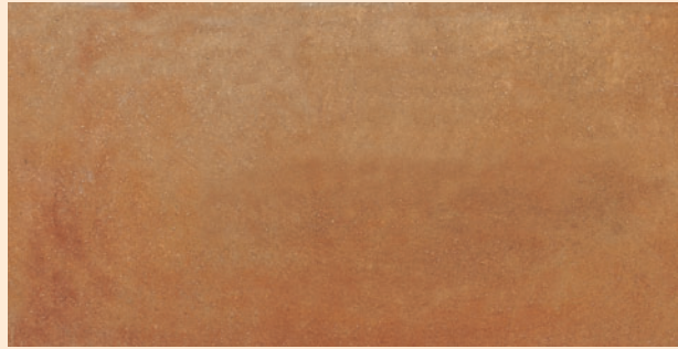
Malay Tan Stain Buckskin Suede Tone with Carmel Marbling