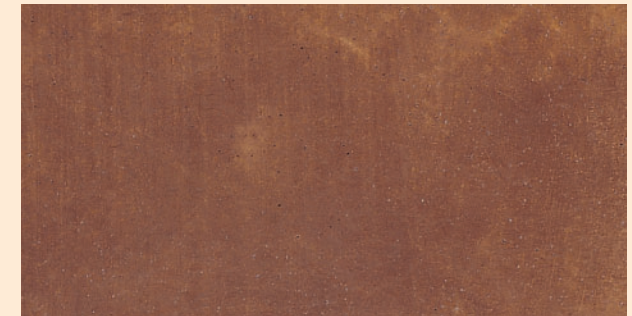
Vintage Umber Stain Rich earthy brown