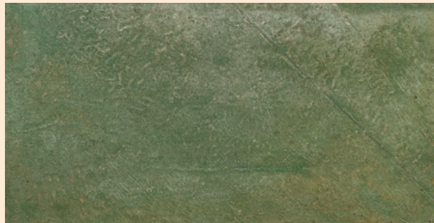
Green Lawn Stain Soft Grey Green Resembling Aged Italian Marble

We look forward to assisting you or your client in creating beautiful, durable, and affordable stained concrete projects.