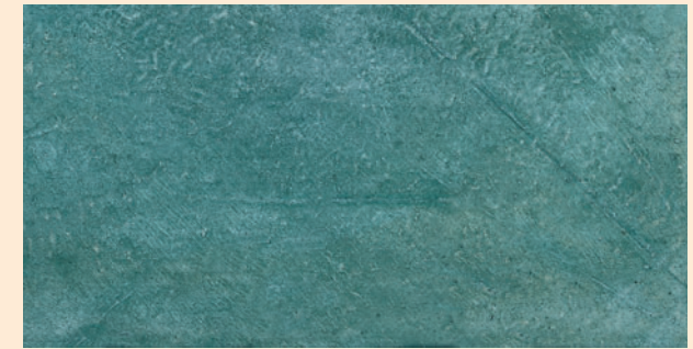
Aqua Blue Stain Soft blue patina with undertones of green