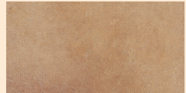
Golden Wheat Stain Amber hued undertones