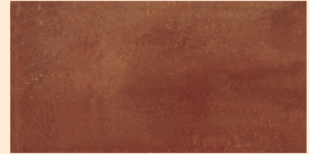
Cola Stain Reddish Brown Resembling Old Leather