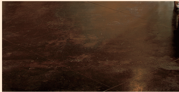
Black Stain Tortoise Shell Black with Brown Marbling